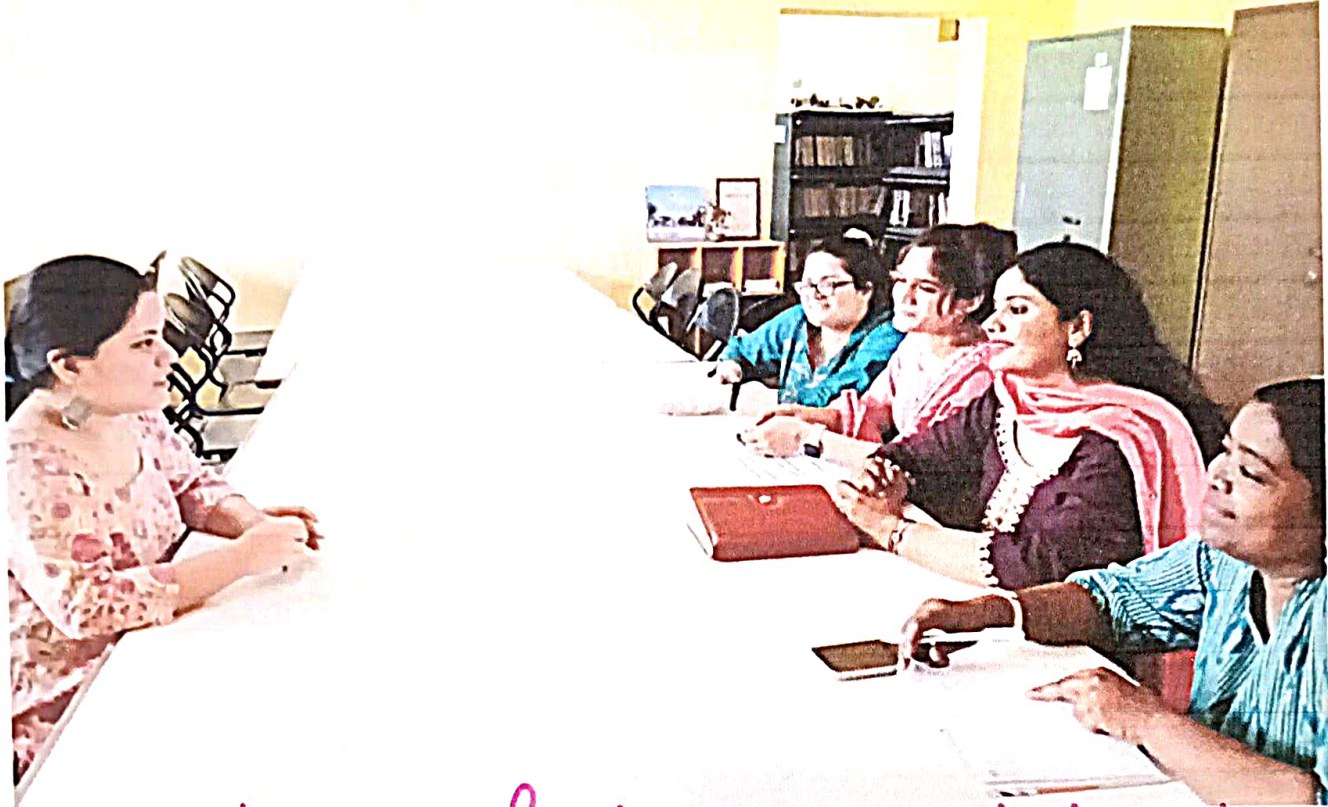
B.Ed students facing mock interviews:-